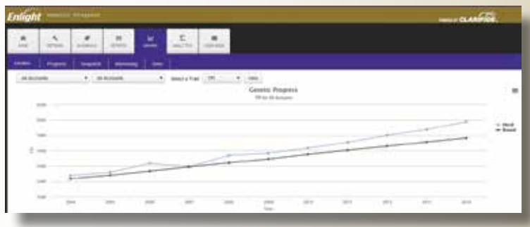
Genetic Progress Graph