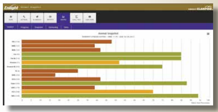
Animal Snapshot Graph